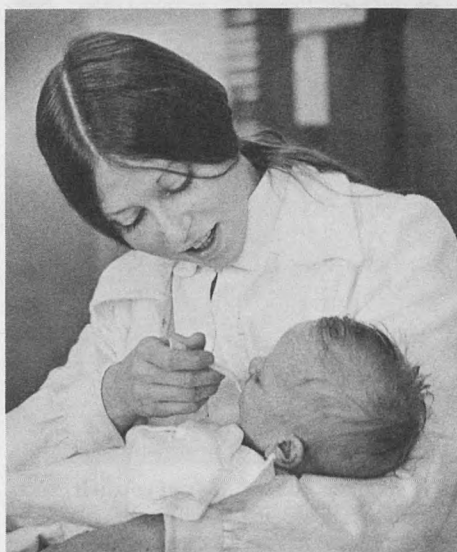
Last year, 62,392 inpatients received 640,750 days of care at the Medical Center.