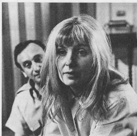
Joanne Woodward, star of "Rachel, Rachel"