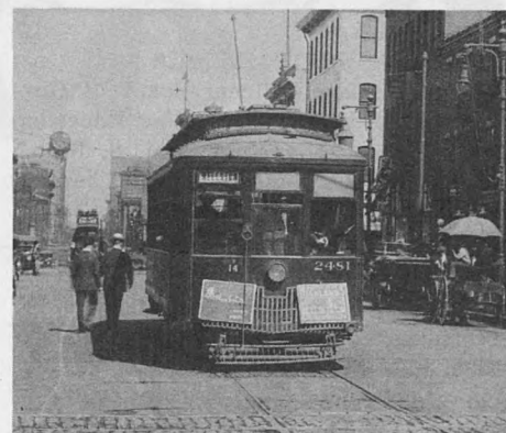
An early streetcar on 12th Street in downtown St. Louis, from the St. Louis Car Company Collection.

An exhibition on view at Olin Library's fifth level from 8:30 a.m.-5 p.m. weekdays highlights the University's collecting interests in business and transportation histories.