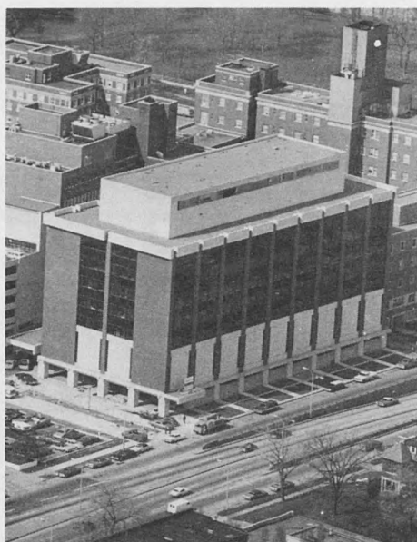
The Sydney M. Shoenberg Pavilion