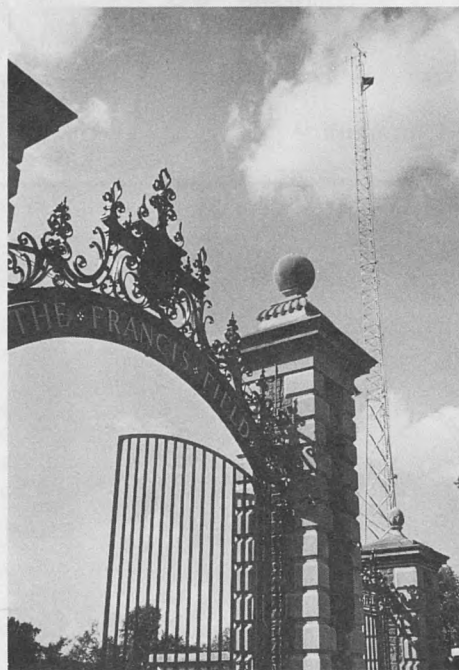
The EPA will hold an open house from 11 a.m.-4 p.m. Wednesday, Oct. 23, to explain the operation of this air pollution tower on Francis Field.

An air pollution monitoring system has been installed at the edge of Francis Field as part of an area-wide experiment by the Environmental Protection Agency.