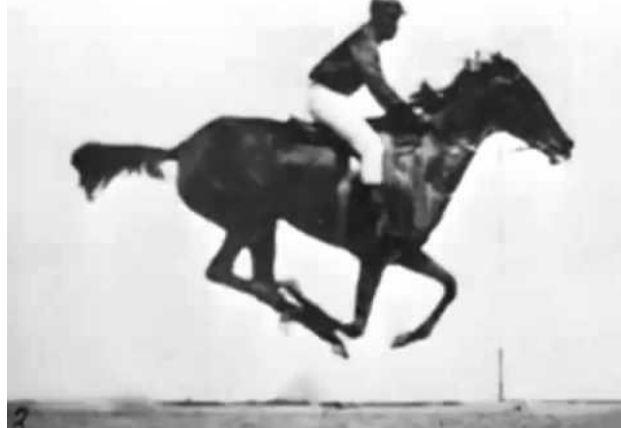
Eadweard Muybridge and the proof of the bet

When a horse is running or trotting, do all four hooves ever leave the ground at the same time? That was the wager that the former Governor of California, Leland Stanford had with some of his friends. There was much controversy in horse racing circles at the time, and though most people believed that a horse always has one hoof in contact with the ground, Stanford thought otherwise. Because a horse's legs are moving so fast, it's