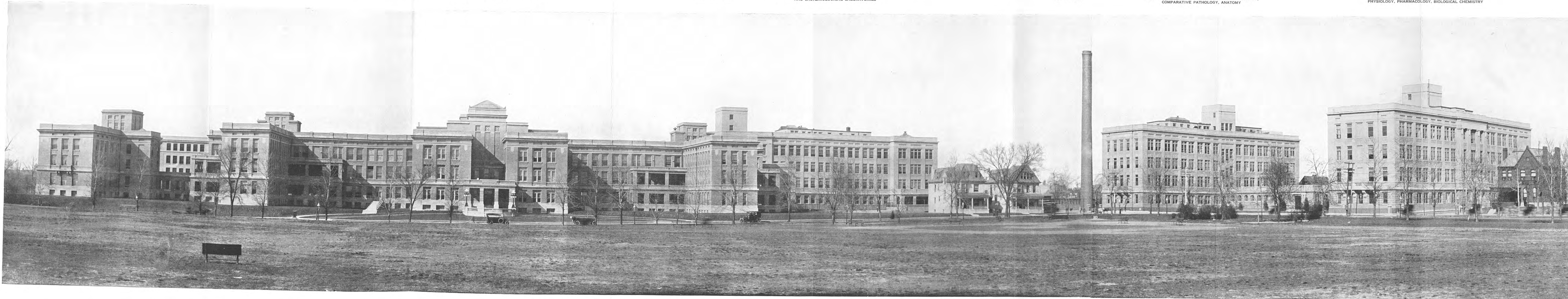
THE WASHINGTON UNIVERSITY SCHOOL OF MEDICINE AND AFFILIATED HOSPITALS