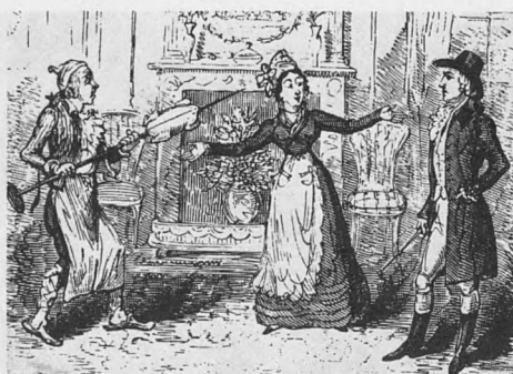
Christmas cards, with designs from University materials, are available at Olin Library's Administrative Office. The cards are 10 for $2.50. The above design was done by 19th century artist, George Cruikshank.