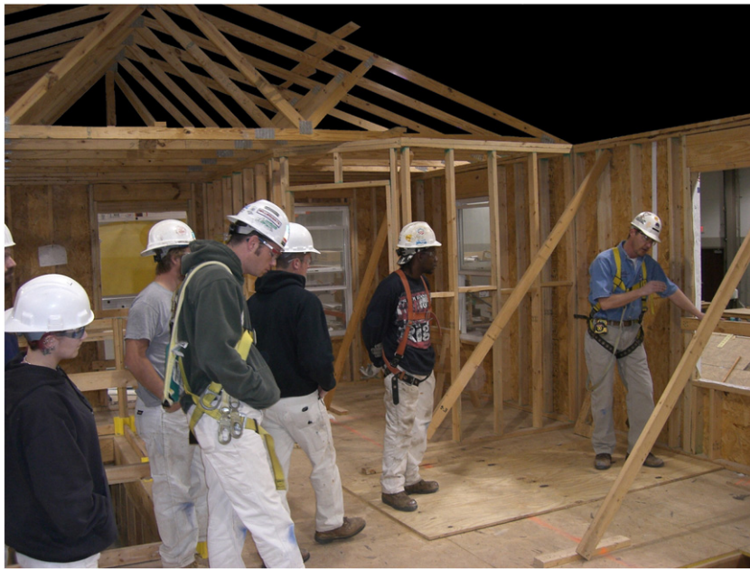
Fig. 2. Mock home demonstrates fall safety hazards and fall protection methods.

systems to vertical life lines. At least one apprentice per class steps off of a scaffold to experience suspension from a life line by the harness, explaining to classmates the uncomfortable sensations associated with this. Lectures and movies continue to be used, however, they are always followed up with practice in the shop to apply what was discussed. We continue to provide apprentices with the OSHA regulation book and orient them to the fall prevention sections, however, highlighting the book is rarely used.