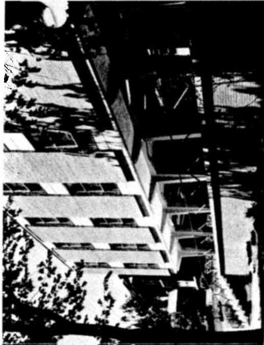
New Residence Hall at Central Institute.