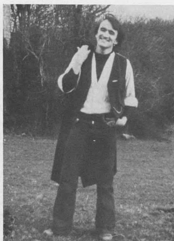
British folk singer Martin Carthy performs March 15, 8 p.m., in the Gargoyle. Call Ext. 5998 for details.

8 p.m. Mallinckrodt Programming Board Concert, with folk singers Utah Phillips and Rosalie Sorrels. The Gargoyle, lower level Mallinckrodt. Admission