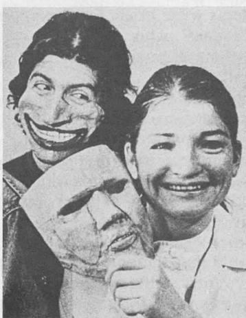
The Provisional Theatre