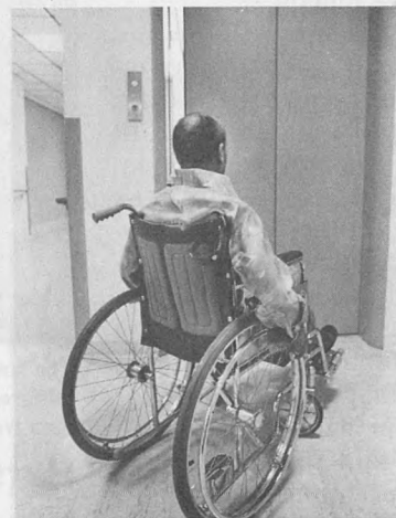
A disabled student waits for an elevator, one aspect of University efforts to adapt the campus to the needs of the disabled.