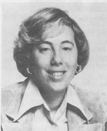
Rosabeth Moss Kanter