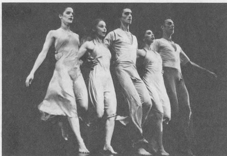
The Phyllis Lamhut Dance Company, known for its high energy, wit and stunning technique, will perform at 8 p.m., Feb. 29 and March 1, in Edison Theatre. For ticket information, call the Edison Theatre Box Office at Ext. 6543.

Timothy Burns Gallery hours are: noon to 6 p.m., Tuesday through Sunday; noon to 9 p.m., on Wednesdays and by appointment. For more information, please call 361-7466 or 367-5460.