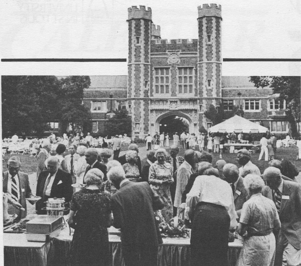
Alumni reunion weekend winds up with a dinner dance in Brookings Quadrangle.