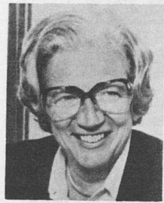
Hanna Holborn Gray