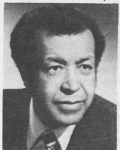
A. Leon Higginbotham