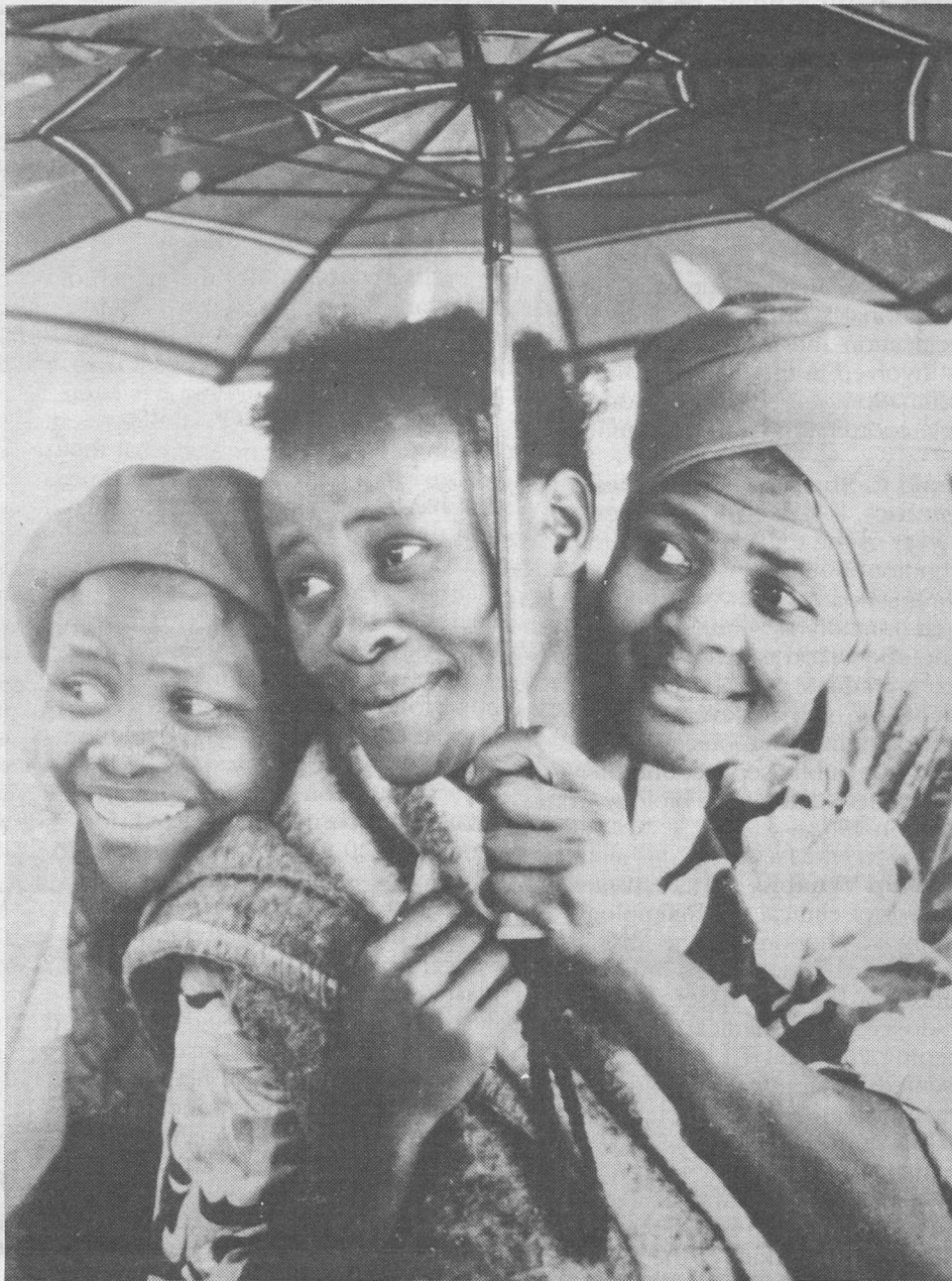
Season opener: The Market Theatre of South Africa will open Edison Theatre's 1989/90 "OVATIONS!" series with the play "You Strike the Woman, You Strike the Rock" at 8 p.m. Friday and Saturday, Sept. 22 and 23. Tickets are $16; $12 for senior citizens and Washington University faculty and staff; and $8 for students. For more information, call 889-6543.