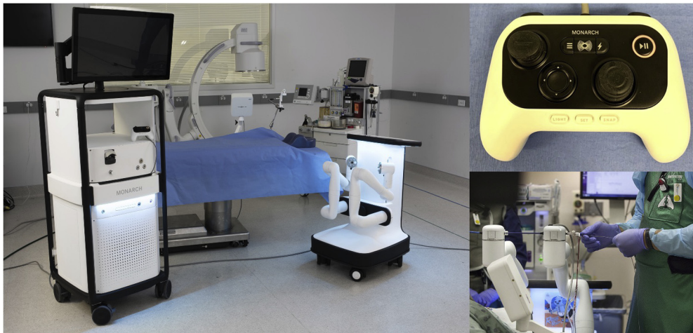
Figure 1 – Robotic bronchoscopy components: Robotic tower and handheld controller.

Radial ultrasound images were recorded as “concentric” when the ultrasound representation of the targeted lesion surrounded the R-EBUS imaging probe and “eccentric” when the ultrasound image was biased to one side of the probe with no component of the lesion surrounding the probe. If no lesion could be identified with the use of R-EBUS imaging, this was also recorded.