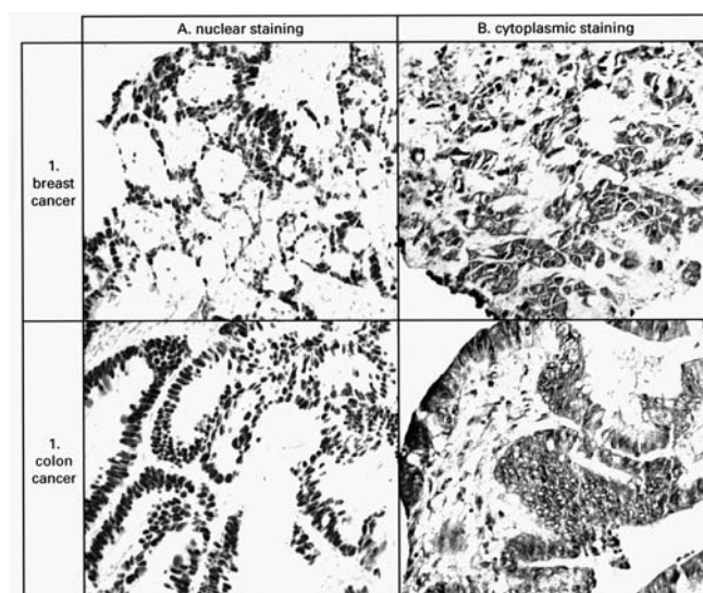
Figure 3. Immunohistochemical detection of p53 and MAGED2 in human cancer tissues. Shown are representative photomicrographs of sections of breast cancer (1A, 1B) and colon cancer (2A, 2B) depicting nuclear (1A, 2A) and cytoplasmic staining (1B, 2B). Original magnification x200.

The present study demonstrates that MAGED2 can, like its homologue, NDN, be placed into a group of p53-interacting proteins. Both MAGED2 and NDN belong to the MAGE superfamily (31) the precise cellular role of which remains unclear. The clearest evidence of a physiological role for the MAGE genes has come from NDN which appears to be playing a role in the development or maintenance of hypothalamic neurons by enhancing p53-induced cell cycle arrest yet, intriguingly, inhibiting p53-mediated apoptosis (26,32,33). In other words, NDN facilitates cell cycle arrest but promotes cell survival of nerve cells. Our observed lesser degree of reduction of p53 transcriptional activity induced by the highest concentration of FLAG-MAGED2 in H1299 cells may be, as stated above, cell-type specific; it may also suggest that the interaction between p53 and MAGED2 may be labile and