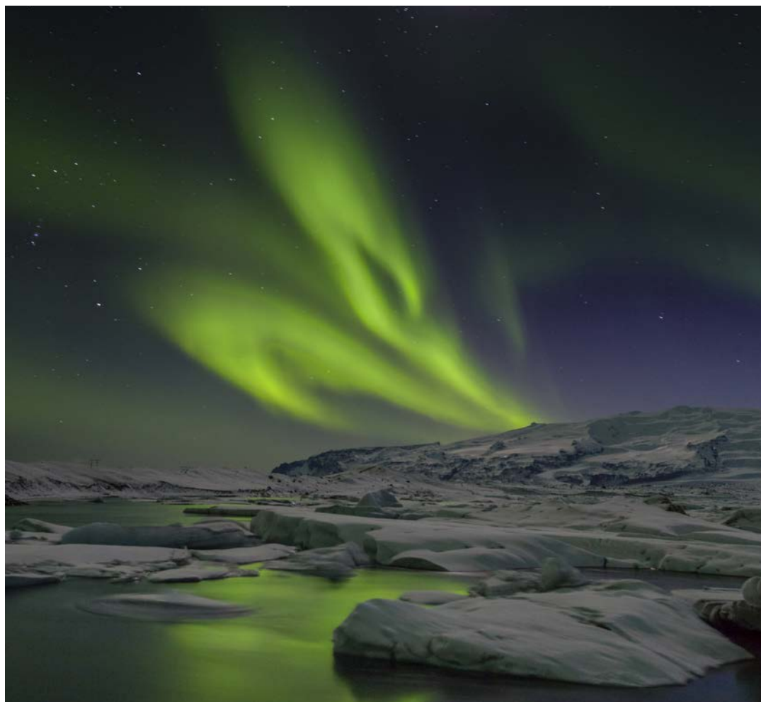
Aurora Borealis, Iceland

Copyright © 2013 Massachusetts Medical Society.