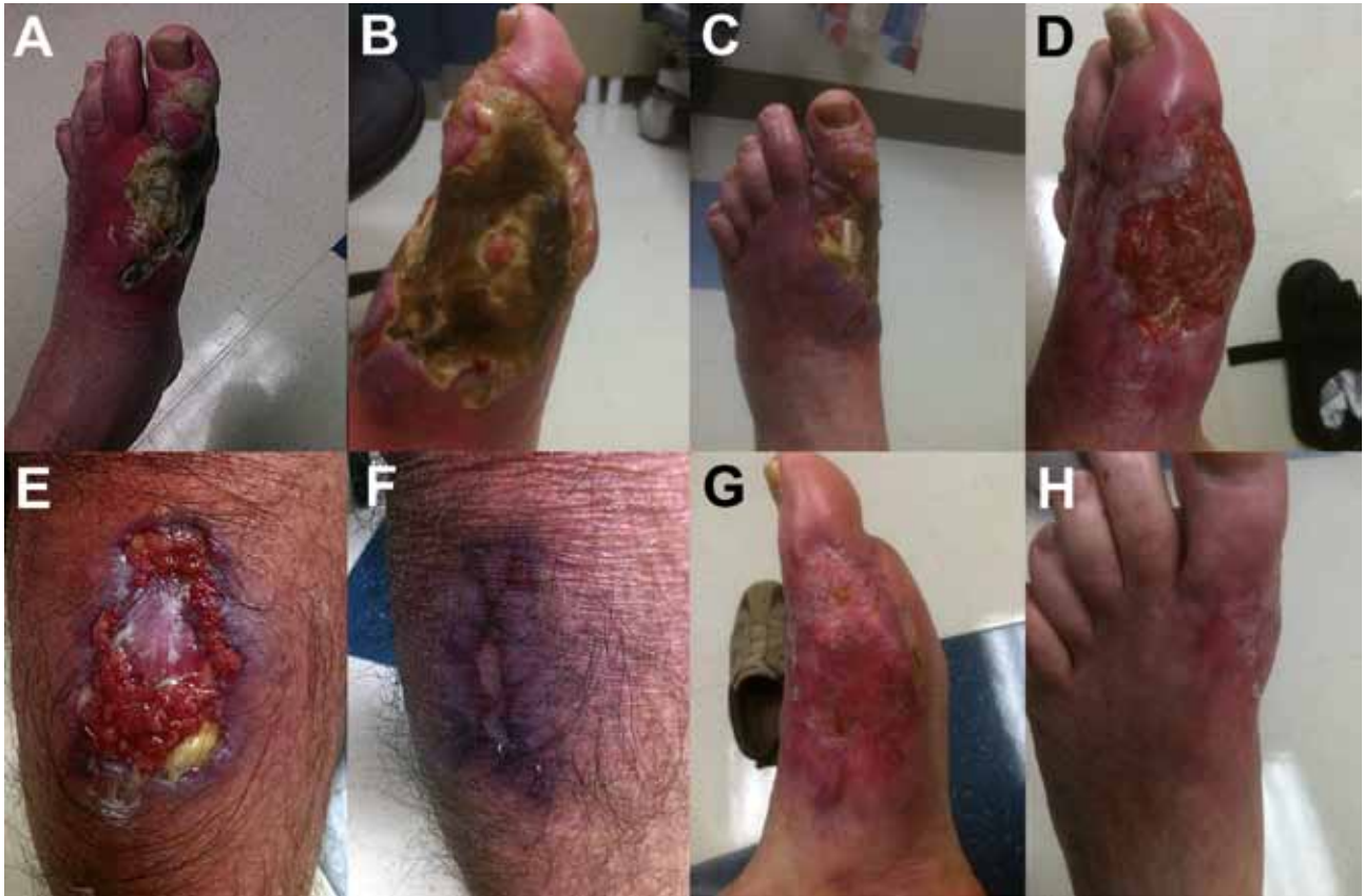
Figure. Progression of lesions caused by Mycobacterium ulcerans infection before, during, and after treatment. A–C) Left foot before treatment. D) Left lower leg during treatment. E) Right calf before treatment. F) Right calf after treatment. G, H) Left foot after treatment.

occur, diagnosis is often delayed. In addition to the case reported here, 3 other cases imported to the United States have been reported in the literature since 1967 (2–4).