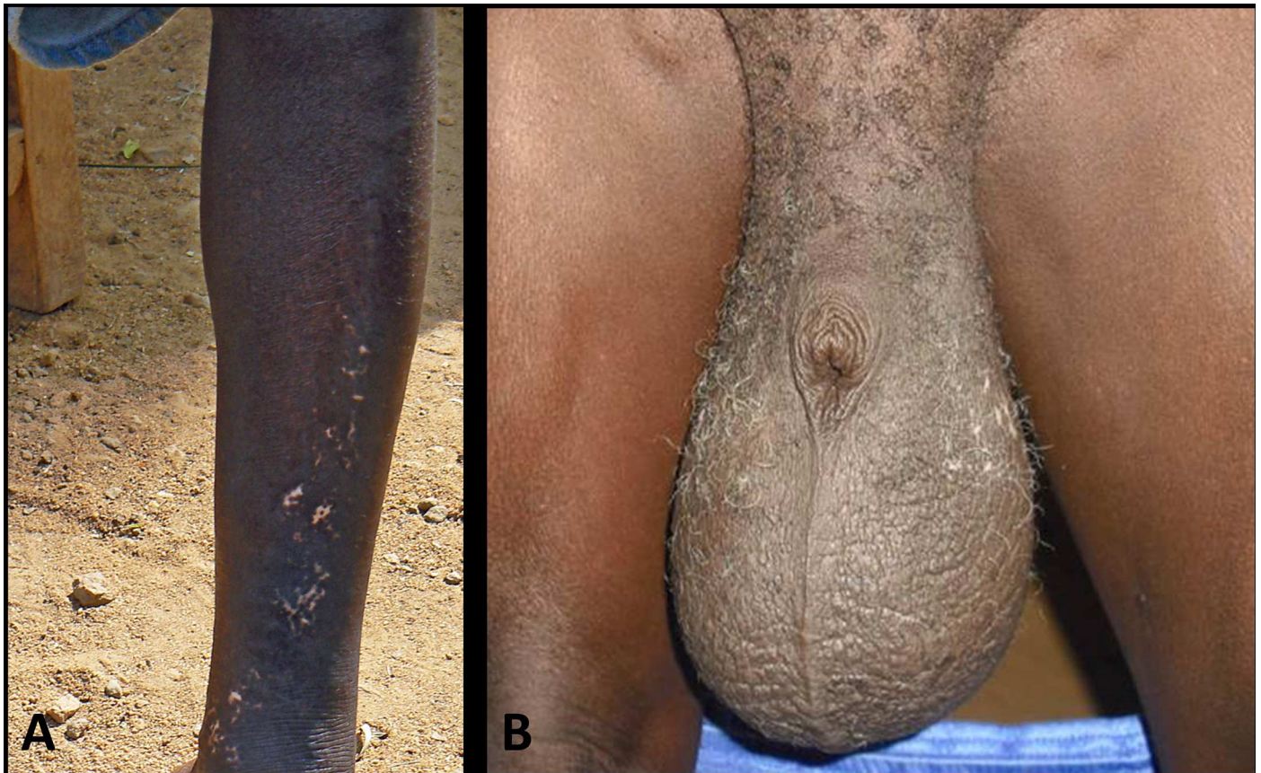
Fig 1. Clinical signs of onchocerciasis (A) and lymphatic filariasis (B) in the same individual living in an area coendemic for both infections in Lofa County, Liberia. A Hypopigmented skin (“leopard skin”) on the shins. B Advanced hydrocele.