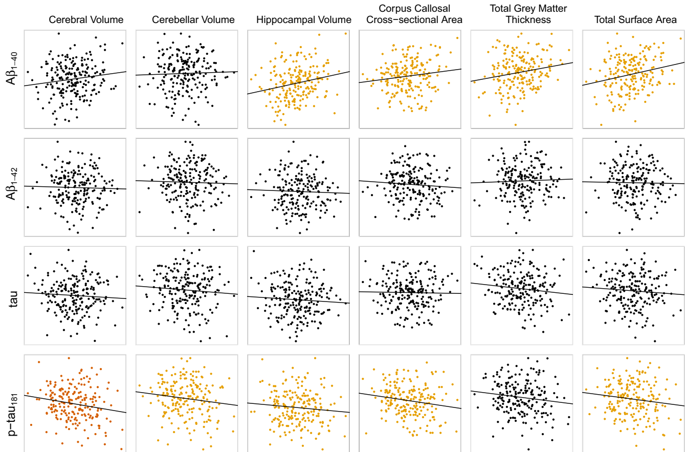
FIGURE 1 Associations between global measures of brain size and CSF biomarkers ( A\beta_{1-40} , A\beta_{1-42} , tau, and p-tau 181 ) in 209 vervets with both CSF collection and MRI scan. Colored points denote the strength of association – non-significant association ( p > .05 , black), suggestive association ( p < .05 , yellow), and significant association (Benjamini-Hochberg corrected p < .05 , red)

was estimated using SOLAR, taking into account age and sex as possible covariates. After correcting for relatedness, CSF A\beta_{1-40} ( p = .001 ) and p-tau 181 ( p = .01 ) were significantly correlated with age, but not A\beta_{1-42} ( p = .46 ) or tau ( p = .31 ). CSF p-tau 181 ( p = .007 ) but not A\beta_{1-40} ( p = .32 ), A\beta_{1-42} ( p = .25 ), or tau ( p = .14 ) was significantly correlated with sex. The CSF concentration of A\beta_{1-40} was found to be significantly heritable ( h^2 = 0.22 , p = .01 ). CSF concentrations of A\beta_{1-42} , tau, and p-tau 181 were not heritable ( h^2 = 0.05 , p = .35 ; h^2 = 0.07 , p = .15 ; and h^2 = 0 , p = .50 , respectively).