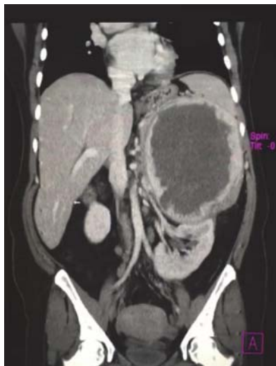
FIGURE 2: Coronal CT image demonstrating the mass displacing the left kidney inferiorly. Evidence of locally invasive disease was not present.

of a large abdominal mass during an abdominal ultrasound. The mass was located in the left upper quadrant and thought to be possibly splenic or renal in origin. Physical examination revealed a large nontender lump arising from the left upper quadrant and crossing the midline. Initial laboratory investigations were unremarkable except for microcytic anemia with a mean corpuscular hemoglobin concentration (MCHC) of 7.3 g/dL. The patient had no history of hypertension, headache, palpitations, or excessive sweating and no family history of cancer.