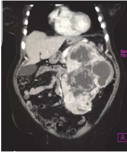
FIGURE 1: CT scan showing a 23 cm, thick-walled, multicystic mass occupying most of the left upper quadrant of the abdomen.