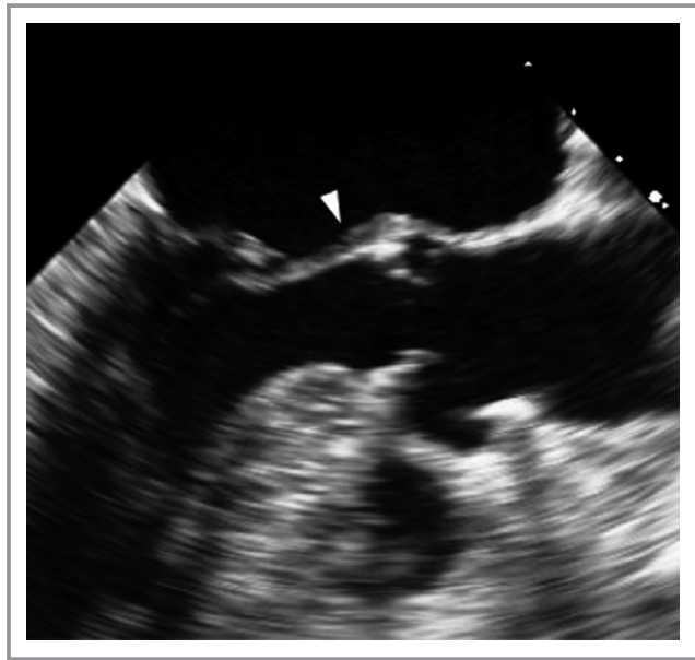
Figure 2. Representative residual MR group patient. The AML was tethered and its base thickened (arrowhead), resulting in reduced leaflet mobility (Video S4). AML indicates anterior mitral leaflet; MR, mitral regurgitation.