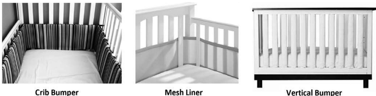
Fig. 1 Three types of crib barrier

Subscribers were offered an incentive to respond to our web survey's email link by entering a lottery for one of ten $100 Amazon gift cards. Five pilot tests with different email subject lines and instructions for 100 randomly selected P&N subscribers found no significant differences in response rates. After three follow-up emails, 12,332 emails were opened and 4070 (33%) were responded to (AAPOR 2016). Inclusion criteria resulted in 1344 eligible respondents who were mothers of singleton infants/toddlers, \leq 24 months old (Yeh et al. 2011), sleeping in cribs (Scheers et al. 2003) using a crib bumper (CB), mesh liner