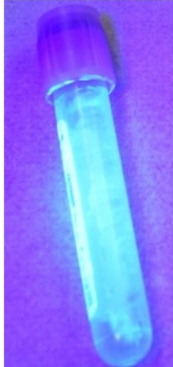
Supplemental Figure 1: Example of a GloGerm treated specimen container in visible light (left) and ultraviolet light (right).