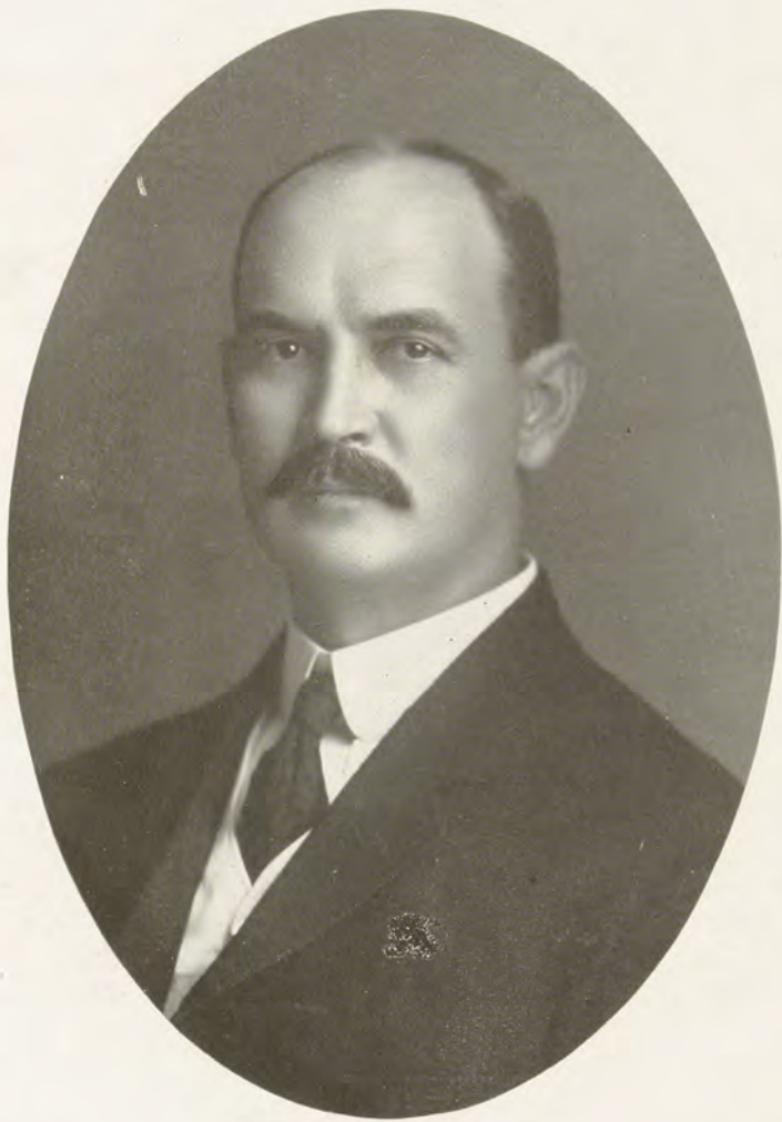
DAVID FRANKLIN HOUSTON.

DAVID FRANKLIN HOUSTON, Chancellor of the University; A.B., South Carolina College, 1887; A.M., Harvard, 1892; LL.D., Tulane, 1903; LL.D., Wisconsin, 1906; Fellow at South Carolina College, 1887-1888; Superintendent of Schools, Spartanburg, S. C., 1888-1891; Graduate Student, Harvard, 1891-1894; President Harvard Graduate Club, 1893-4; Adjunct Professor of Political Science, University of Texas, 1894-1897; Associate Professor, 1897-1900; Professor, 1900-1902; Dean of the Faculty, University of Texas, 1899-1902; President Agricultural and Mechanical College of Texas, 1902-1905; President University of Texas, 1905-1908; member American Economic Association; member Southern Education Board; fellow Texas State Historical Society; author, "A Critical Study of Nullification in South Carolina;" trustee John F. Slater Fund; trustee Rockefeller Sanitary Commission.