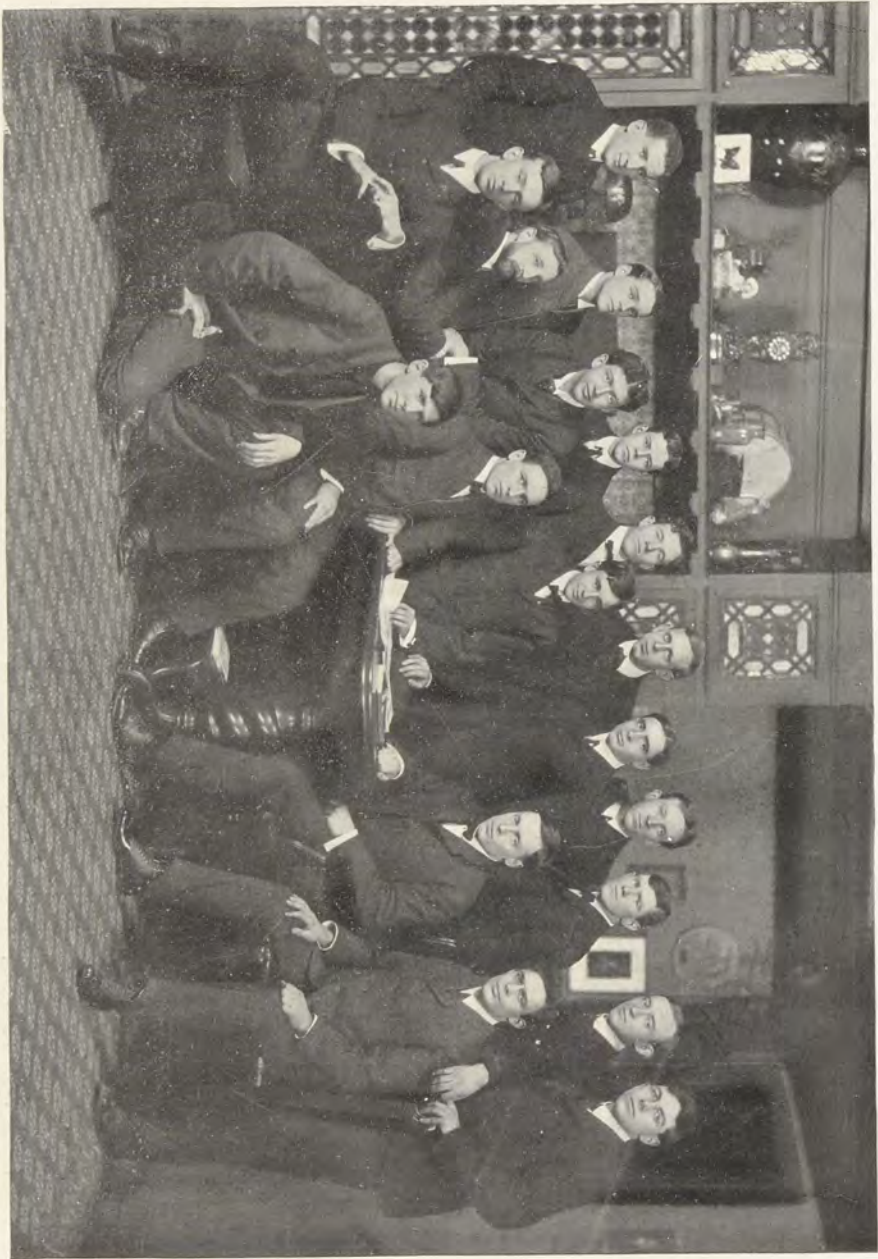
Class Representatives to the Hatcher, '05.