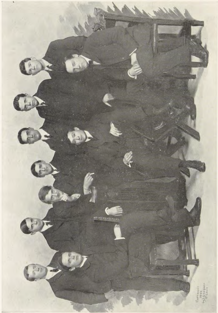
Committee 1914 1915-1916 St. Louis