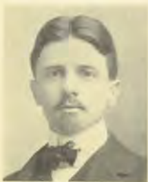
Arthur O. Lovejoy

A.B. Imperial College of History and Philology, St. Petersburg, 1883. Ph.D. Imperial University of St. Petersburg, 1888. Awarded the Gold Medal of the University for the dissertation on Relative Motion. Envoy to European Universities of the Ministry of Russia, 1888-1890. Polytechnic Institute, Zürich, Switzerland, 1891-1893. C.E., 1893. Lecturer on Partial Differential Equations, Harvard University, and on Celestial Mechanics, Johns Hopkins University, 1894. Lecturer on Russia and the Russians before the Lowell Institute, Boston. Associate Professor of Mathematics, Astronomy and Mechanics, Johns Hopkins University, 1895-1898. Professor of Mathematics, Washington University, 1901.