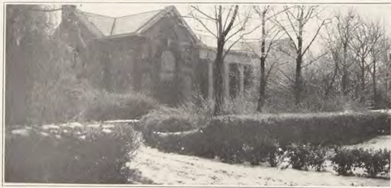
THE ART SCHOOL; NORTH WING.