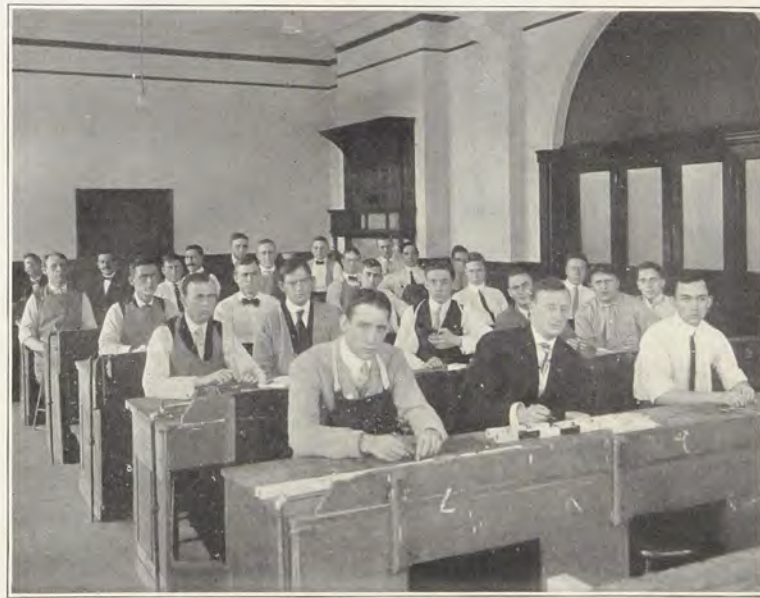
THE FRESHMAN DENTS AT WORK.

The class was told by the authorities that school would be held before the holiday vacation, until Thursday, December 23rd, 1909. This did not meet the approval of the class, so, after having all examinations arranged a few days ahead, every one made it up not to come to school after the eighteenth. This rule was scrupulously followed, and not one of the students came to school between then and the 3rd of January. After that day, however, class was again taken up, and everyone is now busy at his work, and anxiously awaiting the end of the first year at college.