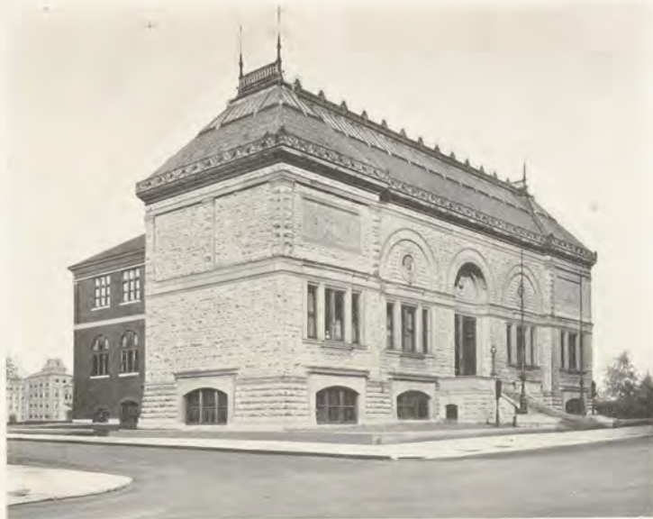
SCHOOL OF FINE ARTS